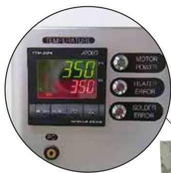
High Power Heater

This robot is the high-powered model of the J-CAT COMET. A 200 watt heater can be added as an attachment and is able to use the larger 2.0mm solder diameter. This machine is most useful in soldering high heat sink applications such as a multilayer board and shielding case.