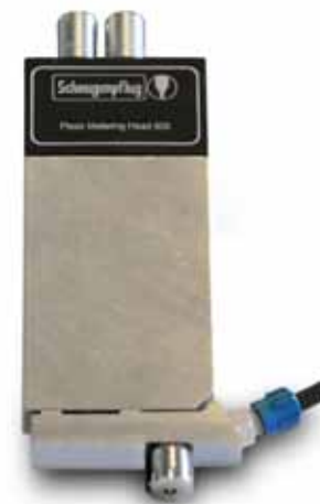
Piezo controlled Dos JetPMU