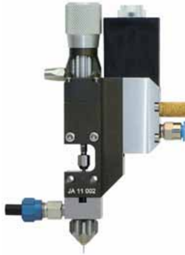
Dos Jet with electropneumatic drive