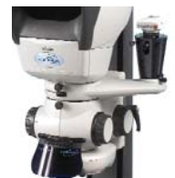
Image capture and archive