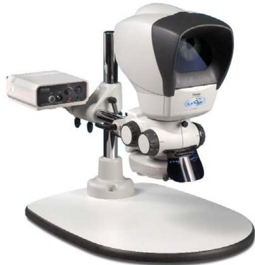
Lynx, with swing away boom mount, for flexibility and ease of use.