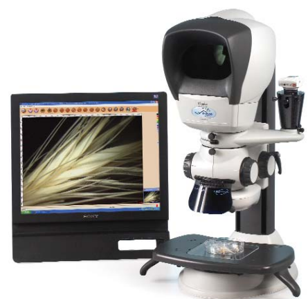
Lynx bench stand with optional image capture accessory and floating stage