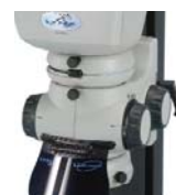
Step magnification multiplier