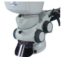
Fixed angle viewer