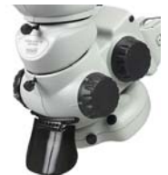
Fixed angle viewer