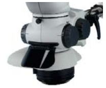
Oblique and direct viewer