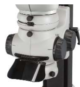
Step magnification multiplier