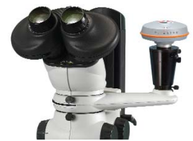
Image capture and archive