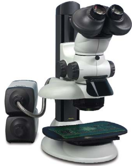
Alpha bench stand with optional oblique and direct viewer.