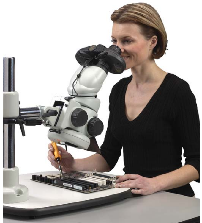
Alpha boom mount with optional fixed angle viewer.

Crank handle option allows convenient vertical adjustment when frequent changes in working distance are required.